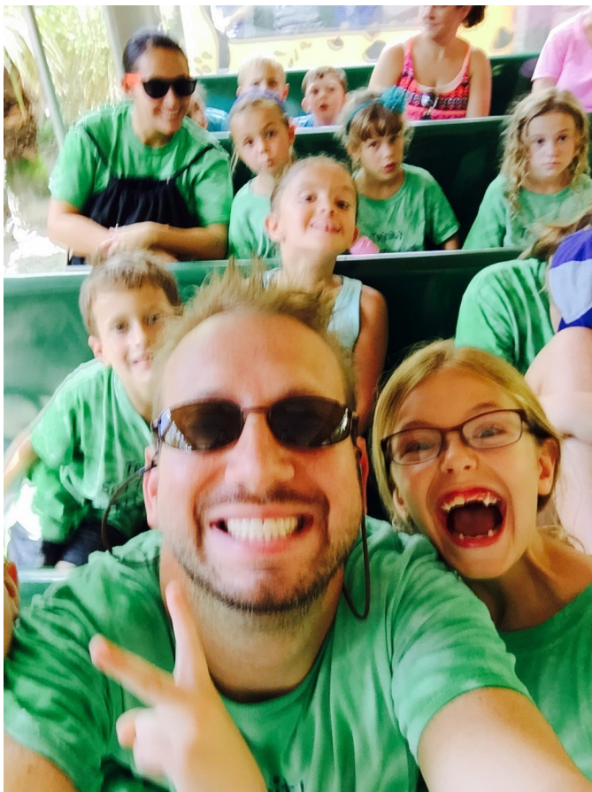
On the Bus