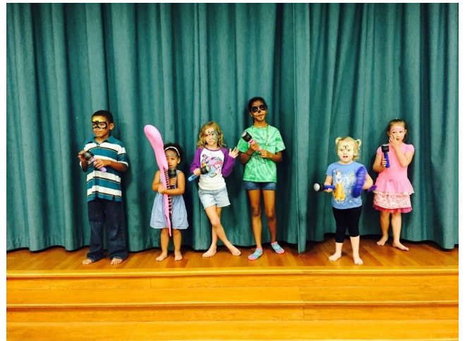
Fun at Camp