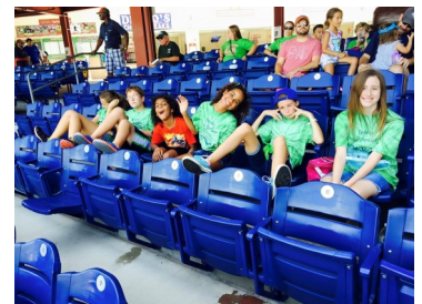
Day at Camp