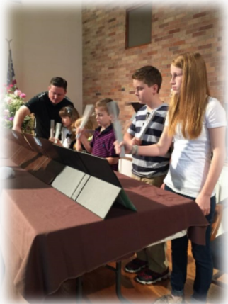
SongChimers in Worship